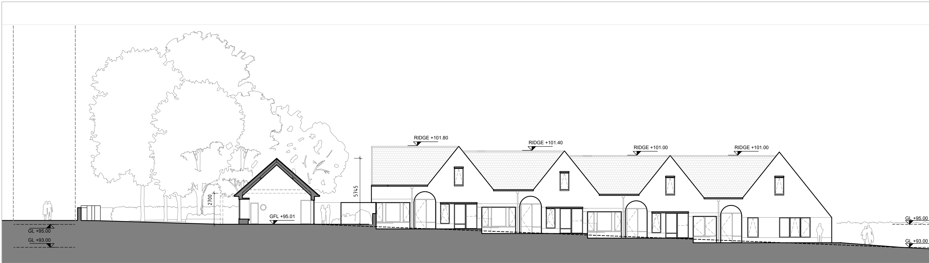
1 SECTION A-A 1:200@A3